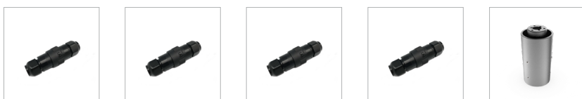
Fast connector IP 2 poles LKITA00000000017 Fast connector IP 3 poles LKITA00000000003 Fast connector IP 4 poles LKITA00000000018 Fast connector IP 5 poles LKITA00000000103 Pole connection Ø 60-80mm LKITA00000000064