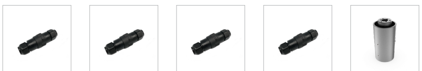
Fast connector IP 2 poles LKITA00000000017 Fast connector IP 3 poles LKITA00000000003 Fast connector IP 4 poles LKITA00000000018 Fast connector IP 5 poles LKITA00000000103 Pole connection Ø 60-80mm LKITA00000000064