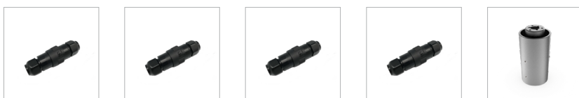
Fast connector IP 2 poles LKITA00000000017 Fast connector IP 3 poles LKITA00000000003 Fast connector IP 4 poles LKITA00000000018 Fast connector IP 5 poles LKITA00000000103 Pole connection Ø 60-80mm LKITA00000000064