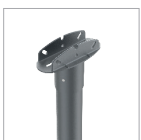
Pole connection B Max 2 x Qm LKITA00000040109