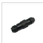
Fast connector IP 3 poles LKITA00000000003