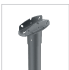
Pole connection B Max 2 x Qm LKITA00000040109