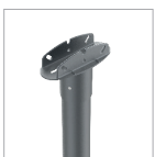
Pole connection B Max 2 x Qm LKITA00000040109