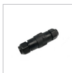
Fast connector IP 3 poles LKITA00000000003