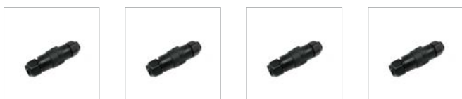
Fast connector IP 2 poles LKITA00000000017 Fast connector IP 3 poles LKITA00000000003 Fast connector IP 4 poles LKITA00000000018 Fast connector IP 5 poles LKITA00000000103