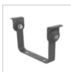
Ceiling kit LKITA00000000013