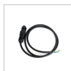
Cable with connector Ca. 2 m., Con 2 poles LKITA00000000040 Ca. 2 m., Con 3 poles LKITA00000000041