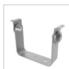
Inox ceiling kit LKITA00000100013