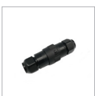
Fast connector IP 3 poles LKITA00000000003