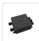
Junction box kit LKITA00000100021