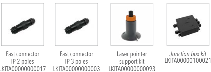
Fast connector IP 2 poles LKITA00000000017