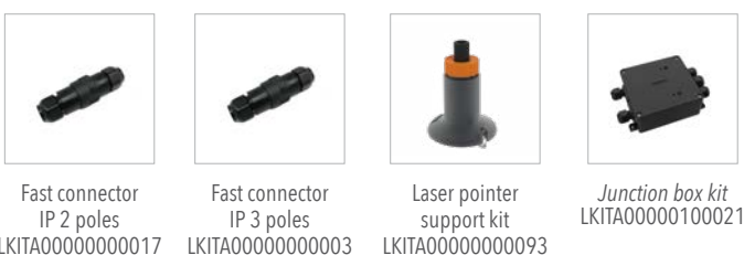
Fast connector IP 2 poles LKITA00000000017