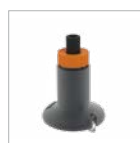
Laser pointer support kit LKITA00000000093