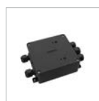
Junction box kit LKITA00000100021