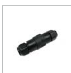
Fast connector IP 2 poles LKITA00000000017