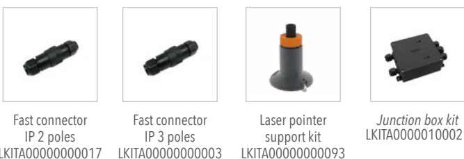
Fast connector IP 2 poles LKITA00000000017