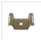
Ceiling kit LKITA00000000031