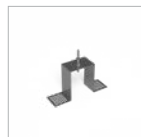
No frame recessed kit LKITA00000000032