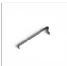
Wall mounting kit LKITA00000000030