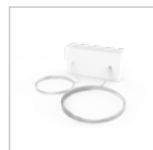
Power kit LKITA00000000034