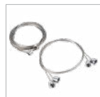
Hanging kit LKITA00000000033