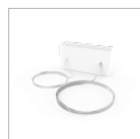
Power kit LKITA00000000034