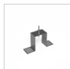
No frame recessed kit LKITA00000000032