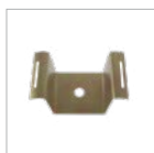
Ceiling kit LKITA00000000031