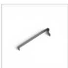
Wall mounting kit LKITA00000000030