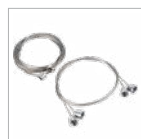
Hanging kit LKITA00000000033